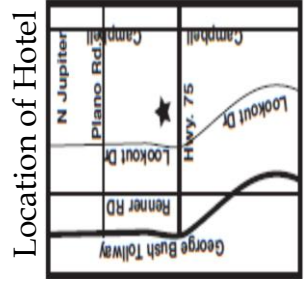
Location of Hotel

DART Stop at the Hotel - Galatyn Park Station